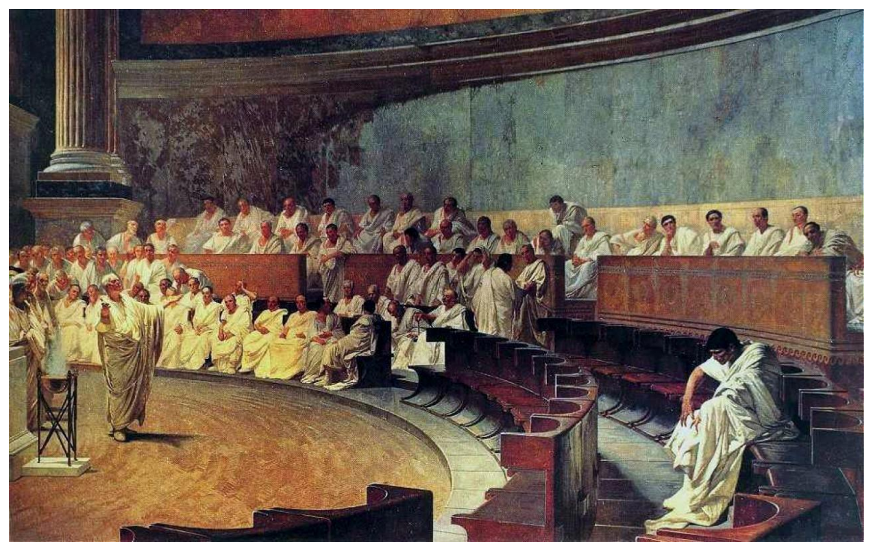
The Roman Senate in the Curia (artist's conception) <a href="https://en.wikipedia.org/wiki/Cicero">https://en.wikipedia.org/wiki/Cicero</a>