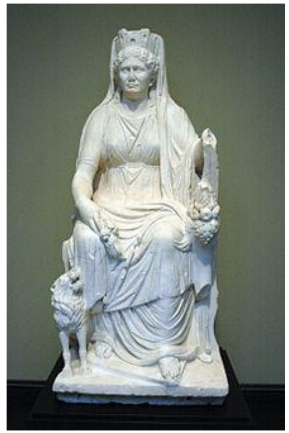
https://en.wikipedia.org/wiki/Cybele (Roman statue, about 50 CE) Getty Museum, Los Angeles

Therefore, to more quickly assure the victory which the fates, the omens, and the oracles all predicted, they began to think out the best way of transporting the goddess to Rome. [Paragraphs that follow describe bringing the goddess—a statue or sacred meteorite—by ship to the city, the procession and placing the statue in a Roman temple for worship.]