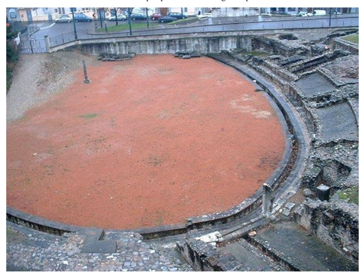
https://en.wikipedia.org/wiki/Persecution in Lyon

Ruins of the place of persecution, the Amphithéâtre des Trois-Gaules , in Lyon. The pole in the arena is a memorial to the people killed during this persecution.