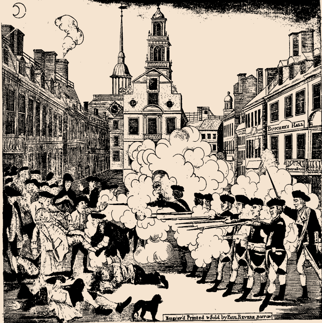
Engraved Printed & Sold by PAUL REVERE BOSTON